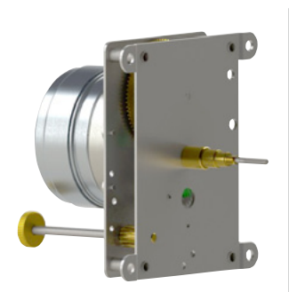
LINK TO DATA SHEET