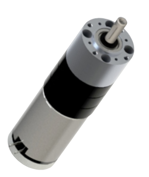
LINK TO DATA SHEET