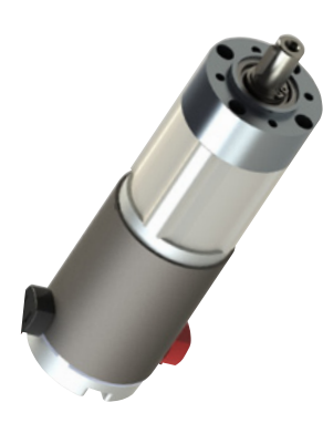
LINK TO DATA SHEET

planetary arrangement a higher torque to volume ratio with low backlash compared to a spur gear arrangement. Gear ratios up to 2653:1 are available. Encoders can also be added.