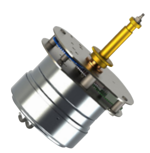
LINK TO DATA SHEET

lifetime routinely exceeds 20 years. Self-resetting is an option with the "C" movement for customers who need to synchronize multiple clocks to a single master clock.