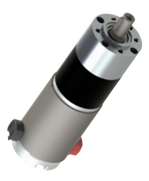
LINK TO DATA SHEET