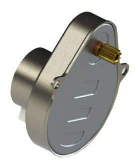
LINK TO DATA SHEET

intermittently and 250 oz-in continuously. Custom output shafts are available.