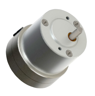
LINK TO DATA SHEET