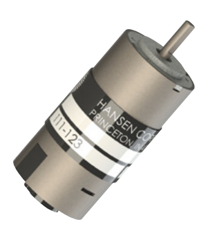
LINK TO DATA SHEET